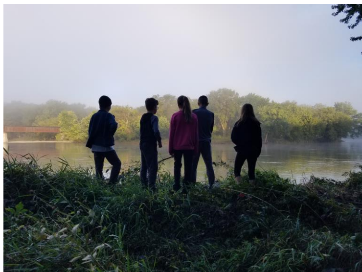
A peaceful morning view of the river