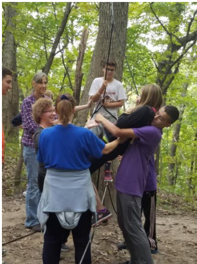
Ropes Course at the Confirmation Retreat, Boone YMCA Camp