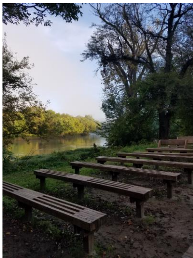
Amphitheater and quiet space