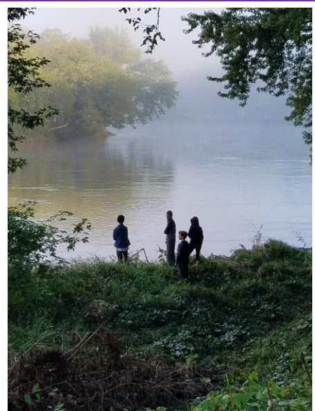
A time to slow down and reflect