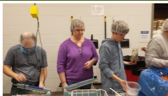
Youth members joined in the effort