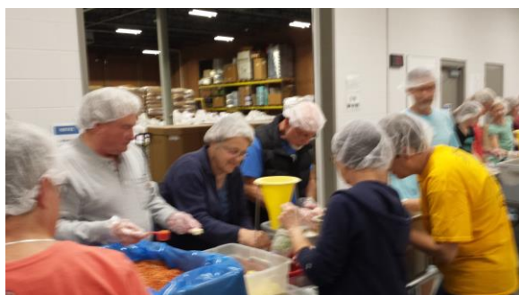
Meals from the Heartland