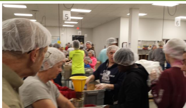
Meals bag packing assembly line