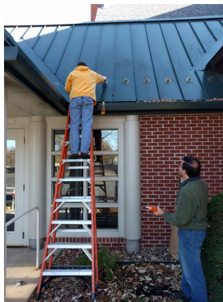
Grace Men's Group meets the second Sunday of each month for breakfast, a devotion, and various tasks around the church. On Nov 12, they assisted the gardening group in spreading compost, re-installed the many plastic "snow-guards" that have come off the metal roof, completed a drywall repair and door-stop installation, and some maintenance on the carpet shampooer.