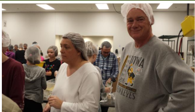
A quick pose, then back to work!