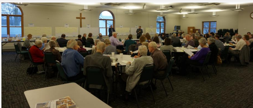
The Annual Congregational Meeting and luncheon, January 22, 2017.