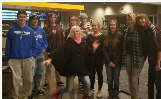
The OWL (Our Whole Lives) Class group comprised of high school youth from St. John's and Grace Lutheran Church, planned a winter break outing to see a movie together. January 2017