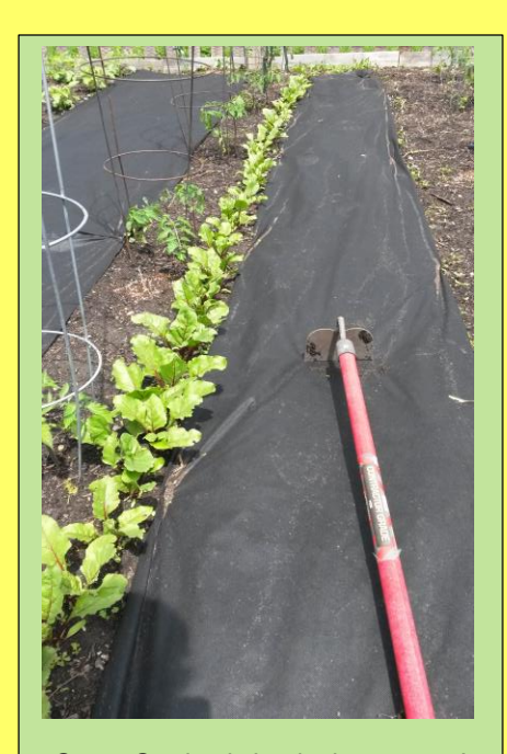
Grace Garden is beginning to grow!