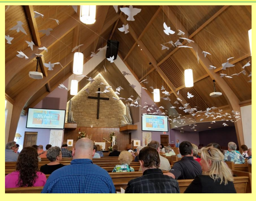
Doves in the Sanctuary Easter morning.

We will start with breakfast, then will continue our devotional, and then we move into project work around the church. (We are currently studying Game Plan For Life by Coach Joe Gibbs, which is a video-based devotional study aimed at helping men to be intentional about leading their lives and their families according to God's game plan.) Recent work included playground repair work for the daycare and other outdoor church repairs and cleanup work. Future projects including painting an office.