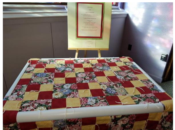
A recent quilt set up in the Sanctuary. Members are invited to say a prayer as they tie a knot before, during, or after the service.