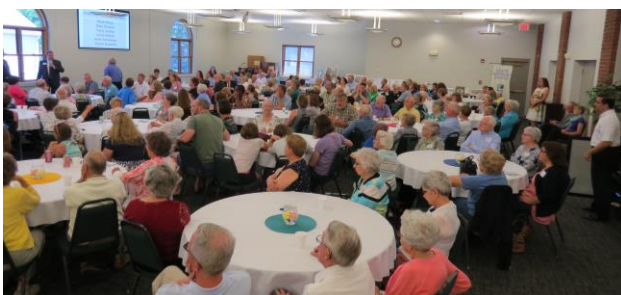
Grace Hall, filled from end to end for a lovely catered luncheon and program.

Limited Edition Prints may be ordered. Forms are available in the office.