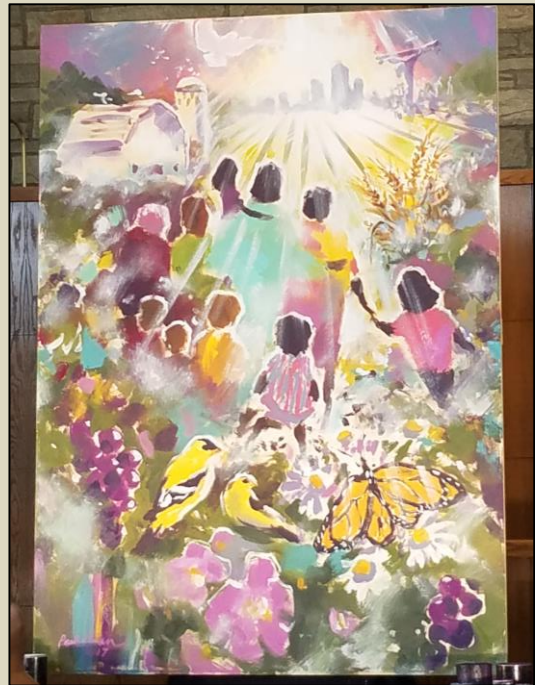
"Alive in Christ"