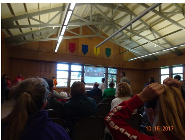
Worship at the 2017 Confirmation Retreat with St. Stephen, Boone Y Camp.