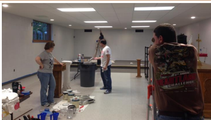
Painting the Chapel for use as the new Bell and Chancel Choir Rehearsal Space.