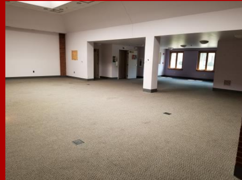
The Gathering Hall cleaned out and ready for renovation!