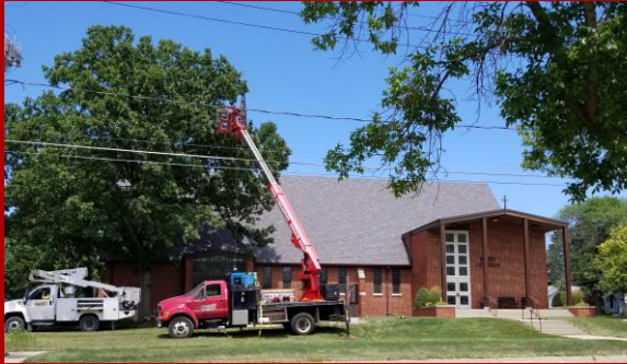
Installation of the new sign