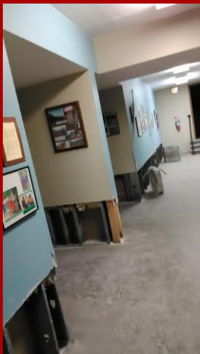
Msindo Hall, wet drywall removed.