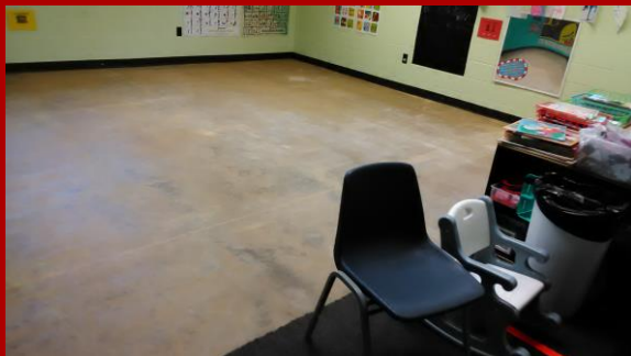
Grace Kids Care Preschool Room after flood cleanup. This room will have a new tile floor soon.