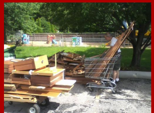
Piles of wet things, waiting for dumpster space.