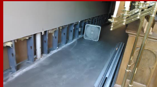
Msindo/Basement after some of the July 30 flood cleanup