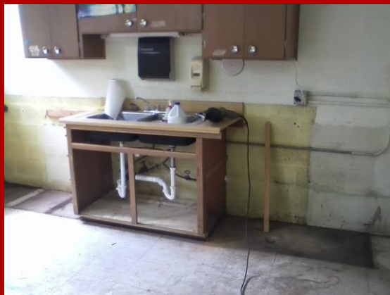
Msindo Kitchen, without soggy cabinets.