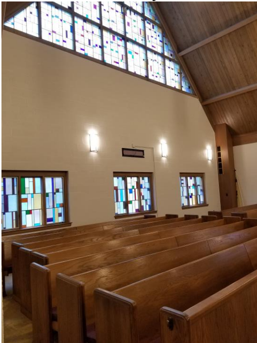
New Sanctuary Paint!