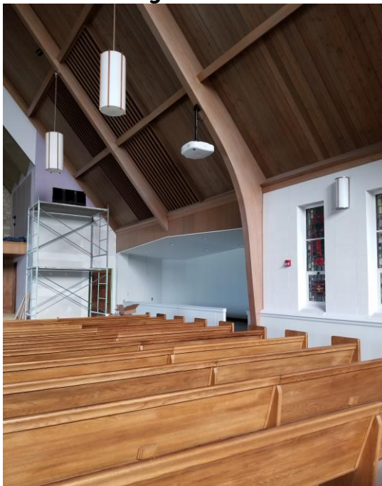
A bright choir loft...