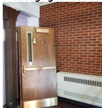
Heavy, solid doors making way for lighter, see-through glass doors