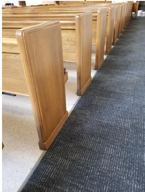
New Sanctuary Carpet!