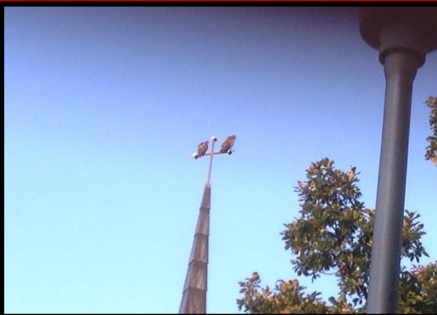
Birds of Pray at Grace