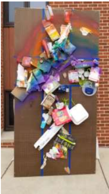
Our "Art of Redemption" Art piece, assembled during VBS worship using recycled items from our homes.

You can find both the worship videos and the VBS videos and resources on the Resources page of our website here: https://gracedm.org/resources/