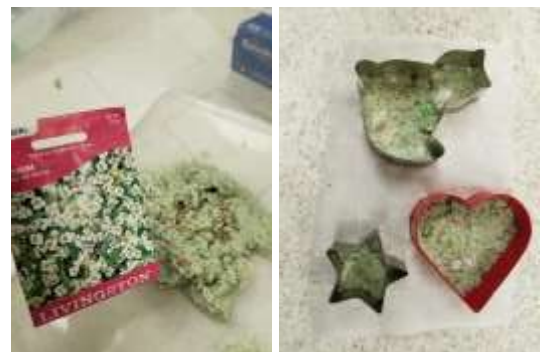
During Seed week we blitzed water and recycled paper in a blender, added a little bit of colored paper, and then a variety of flower seeds! On Sunday we had fun shaping the squishy paper into shapes. The dried seed paper will be mailed to our Homebound members, who can plant it in a pot or their yard.

Join us as we wrap up this summer's VBS!