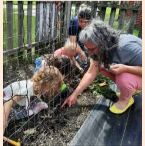
During Grace Kids Care VBS week we planted squash and radish seeds in the Grace Giving Garden, and harvested radishes to see their deep roots.

On Wednesday, June 2 at 6:30 p.m. we will be planting a Maple tree on the East side of Grace, along 52 nd street.