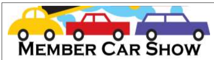
A few scenes from the 2019 car show: