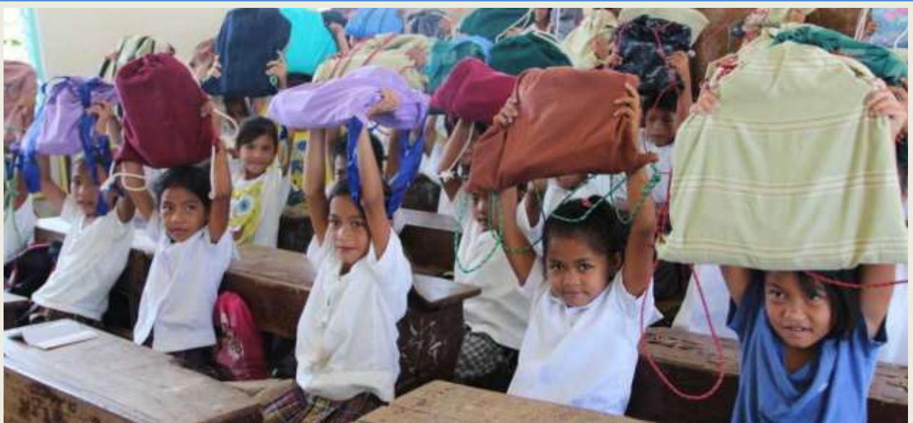
Children in the Phillipines showing off their Lutheran World Relief Blessing Backpacks.

These kits go to children in communities burdened by drought, natural disasters, severe poverty, and political conflict. Without these supplies, families would not be able to send their children to school. We hope to create these kits outside, if weather permits. If not, we will work in Grace Hall. Masks and social distancing will be used. Please join us!