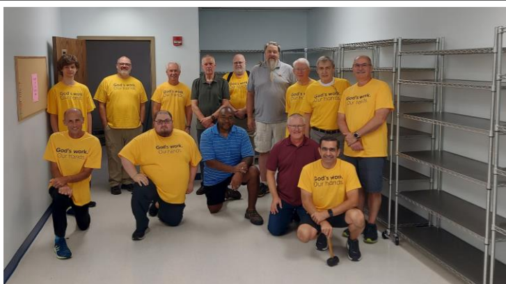
Shelving Assembly crew