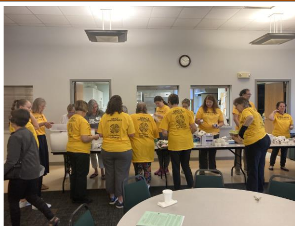
Packing 100 Home first aid kits