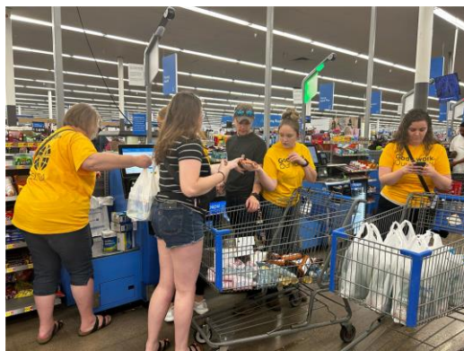
God's Work Our Hands Shopping Groups checking their purchases for Moore's Personal Hygiene Pantry