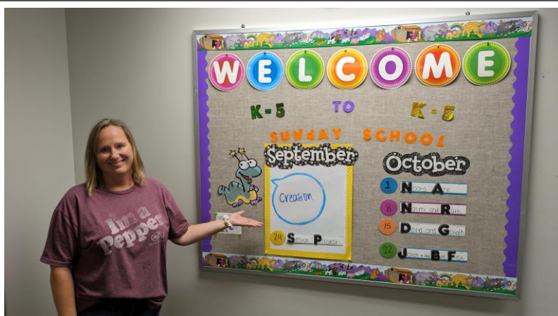
All ready for Sunday School to begin! September 17.