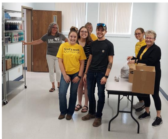
Unpacking & shelf stocking in Msindo