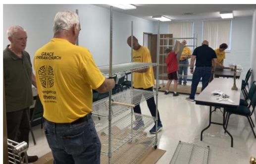
*GWOH