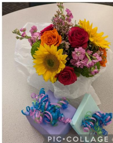
Grace Hall ready for the Lydia & Martha Circle September Meeting