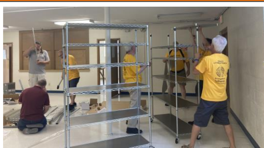
Assembling shelves for the pantry storage room in Msindo Hall