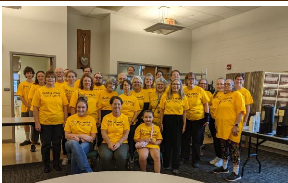
Kit packing crew!