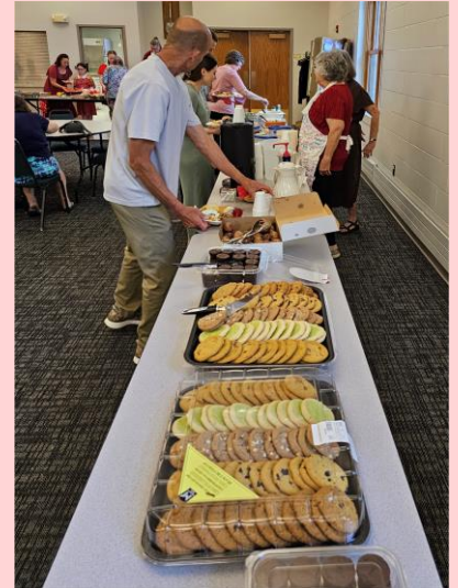
But wait! There's more! Deserts, drinks and our amazing volunteers, plus a whole extra table of salads