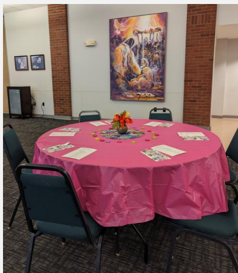
One of the beautifully decorated and welcoming tables for the Circle.