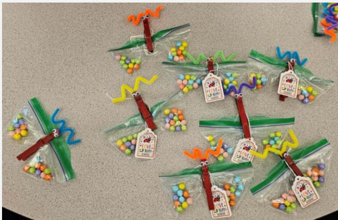
Love Bug treat bags