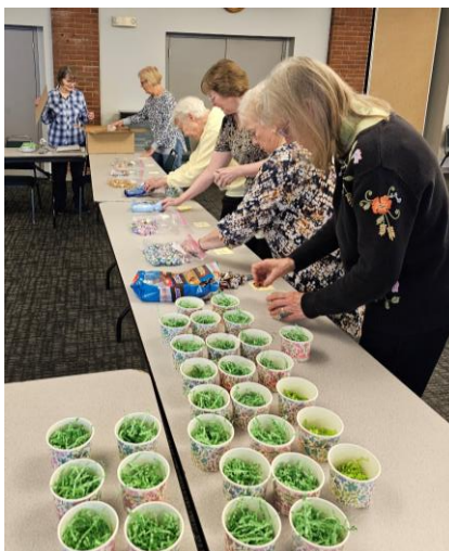
Assembling the May baskets.