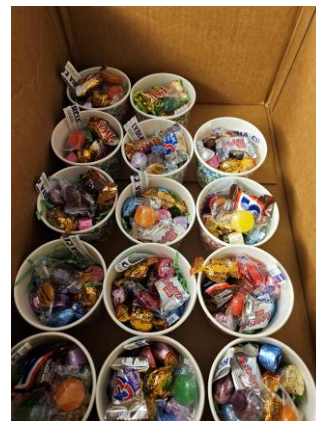
The finished baskets.