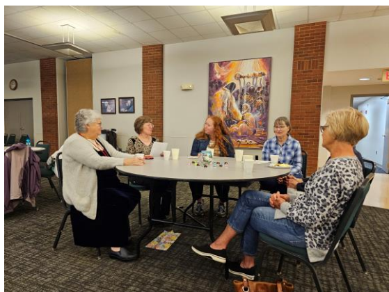
Part of the group enjoying conversation during the April meeting.

You are invited to join in! “We have the best bakers” — a direct quote heard at the April meeting. They are the kindest, most welcoming bunch of ladies you will ever meet! Here are a few photos from their latest meeting where they made May baskets for a local care facility.